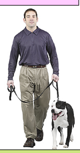
Don't leave your dog's doo doo in your neighbor's yard!!!!

So please, please, please, pick up after your dog and dispose of the waste in your trashcan. If your children walk your dog, please ask them to be considerate and (health-conscious, too) and do the same. If your dog runs into the neighbor's year and does his business, pick it up. No one wants a yard full of poop!